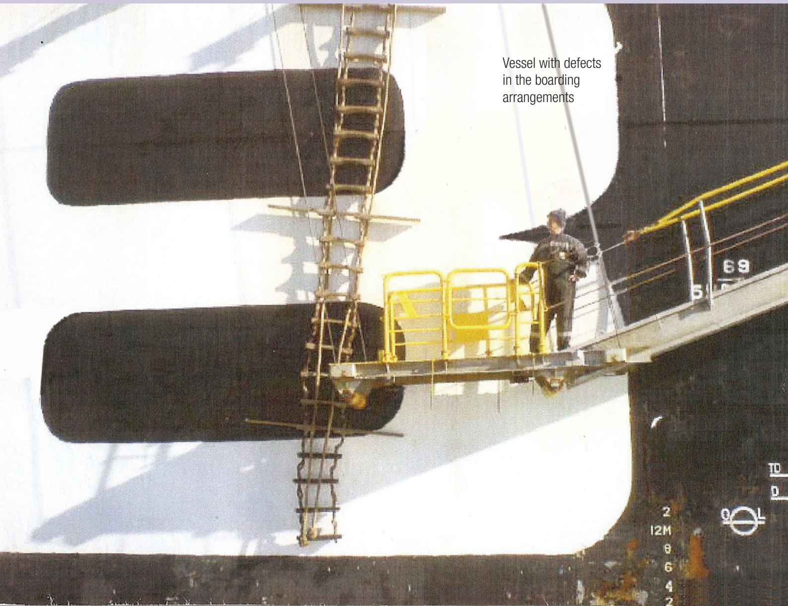
Vessel with defects in the boarding arrangements